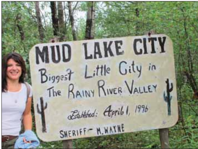
Welcome to Mud Lake City!