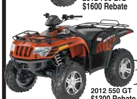
2012 550 GT $1300 Rebate