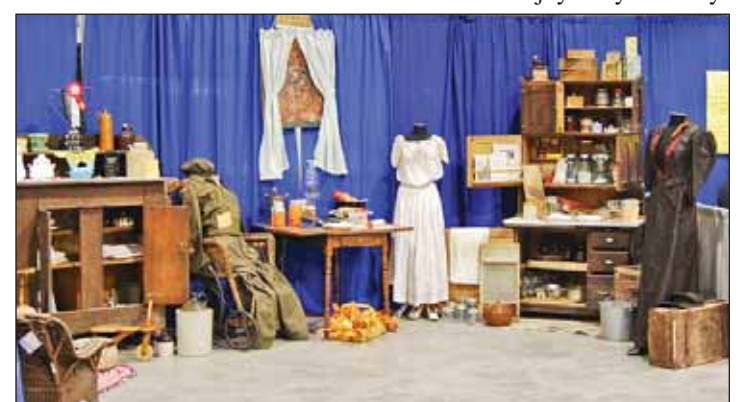
Women's Institute Museum's Pioneer Display at the Emo Arena was awarded 1st Place by the Emo Fair Committee.