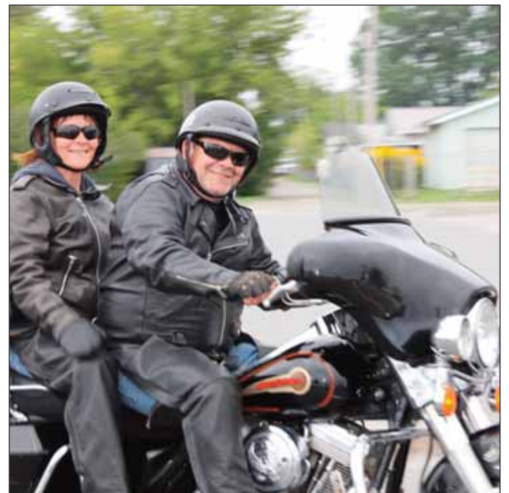
Heading out on the highway for a good cause...safe travels!