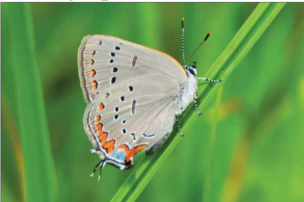
The tiny Acadian Hairstreak butterfly is a regular (but hard-to-spot!) visitor to the Rainy River District. This one was photographed July 17, 2014, near Burriss.