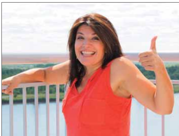
I did it!!! (Sorry, so excited to get to the top and nervous about venturing back down that I didn't take any additional pictures of the view from the top.)

"Earlier today, they had the English toffee and Tim Bits".