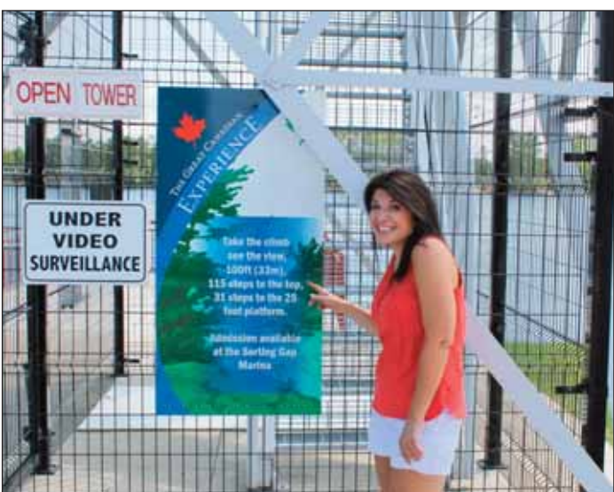
Will she take the Climb? 100 foot tower – 115 steps to the top.