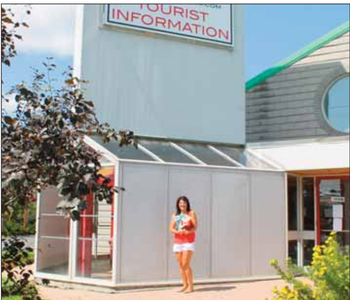
Welcome to Canada!