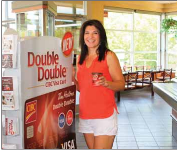
The beginning of my "Tourist for a Day" excursion.