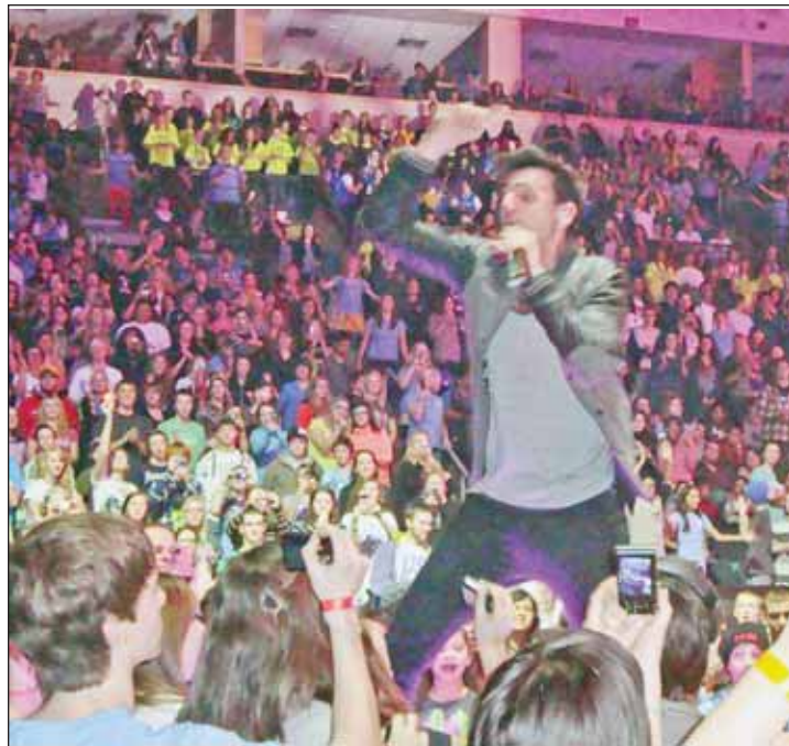
Rock band, Hedley, lead singer Jacob Hoggard performs before the packed house.