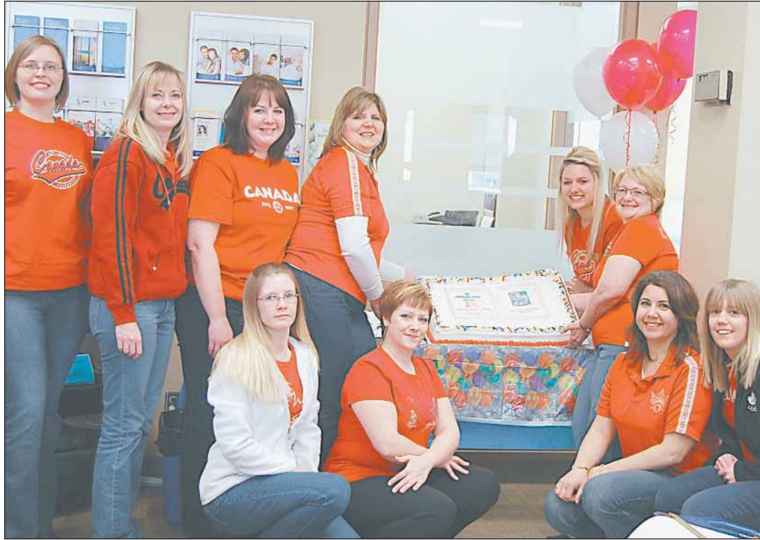
Enthusiastic employees of Royal Bank waiting to welcome people.