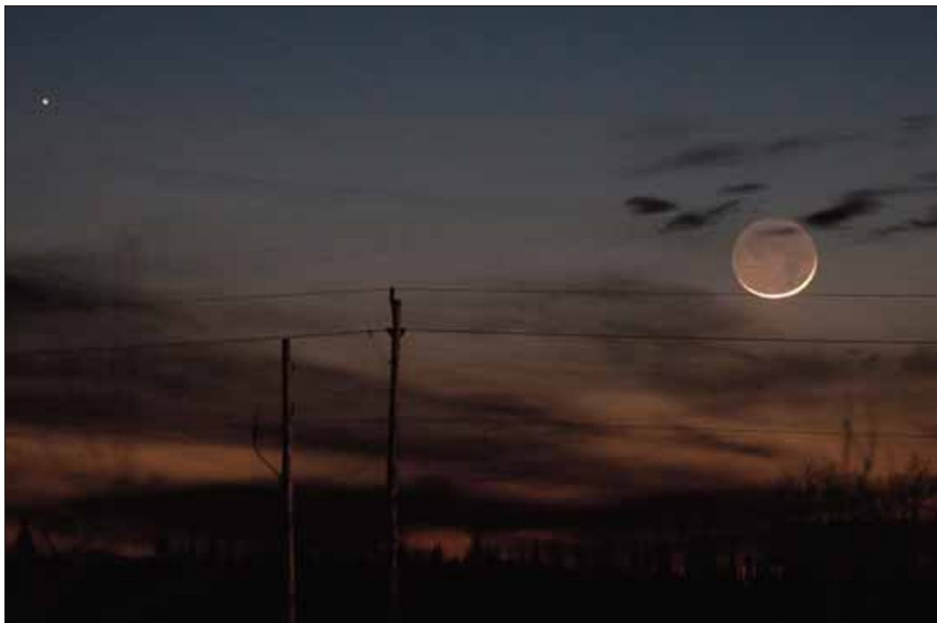
The planet Mercury is the bright star-like object to the left of the Moon. The bright thin crescent "bowl" is reflected light from the Sun, the ghostly glow of the rest of the Moon is called "Earthglow" and is caused by reflected light from the Earth.