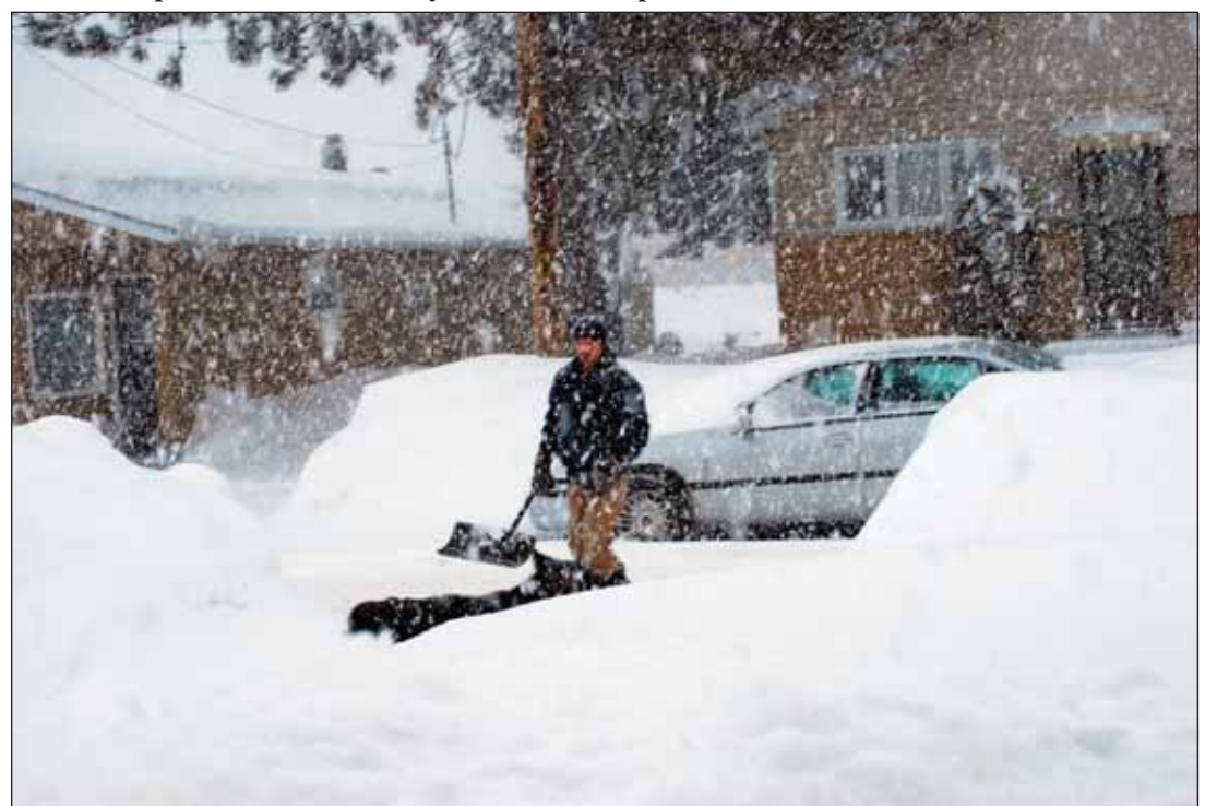
This photo is taken from my front door last year in the first week of January.