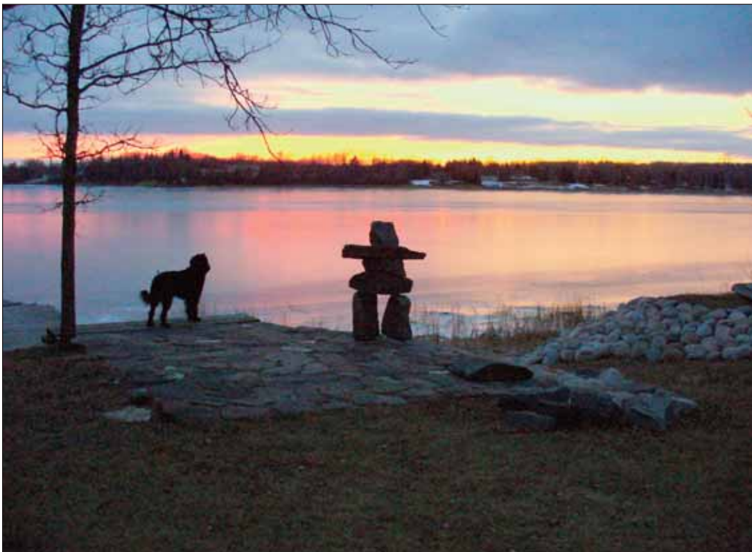
These two watchers teamed up to check on the smooth-as-glass river ice.