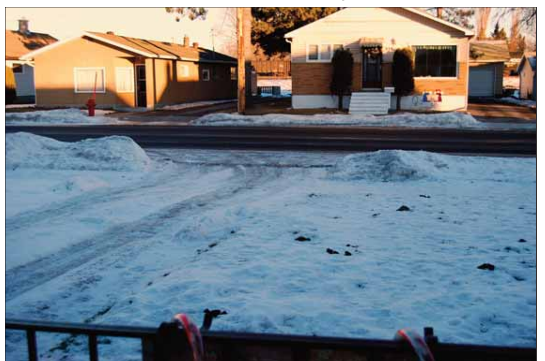
This photo is taken from my front door this past week. Not much work to do here!