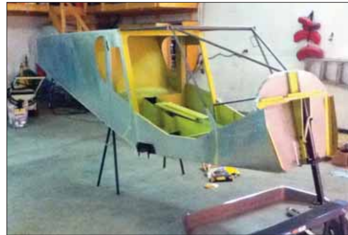
A work in progress – four years to complete from start to finish.

"It's been a long labour of love", he smiles proudly as he looks over at his new plane.