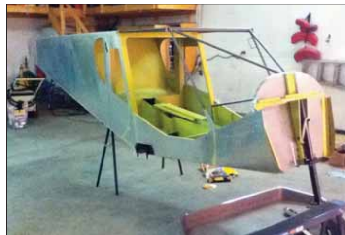
A work in progress – four years to complete from start to finish.

"It's been a long labour of love", he smiles proudly as he looks over at his new plane.