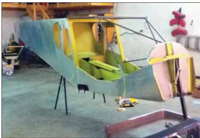
A work in progress – four years to complete from start to finish.

"It's been a long labour of love", he smiles proudly as he looks over at his new plane.