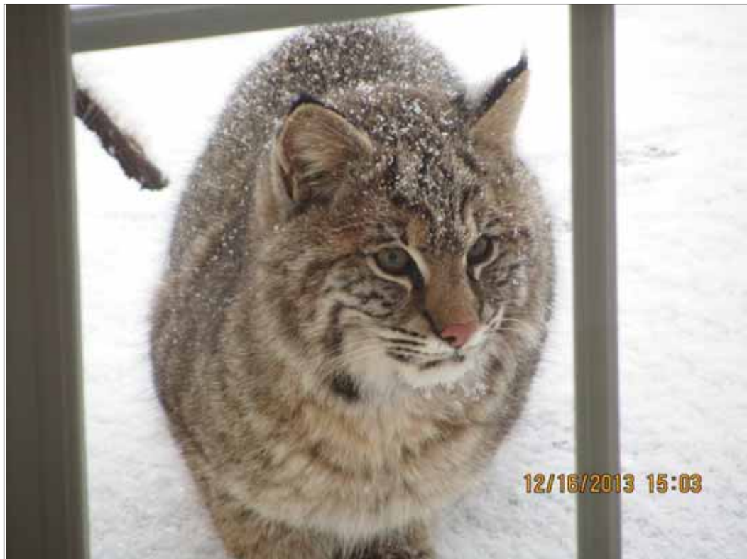
A bobcat on deck looking in through patio door. He/she spent most of the afternoon exploring around the yard and almost seemed tame.

Photo by Bill Parsons, near Gameland, ON