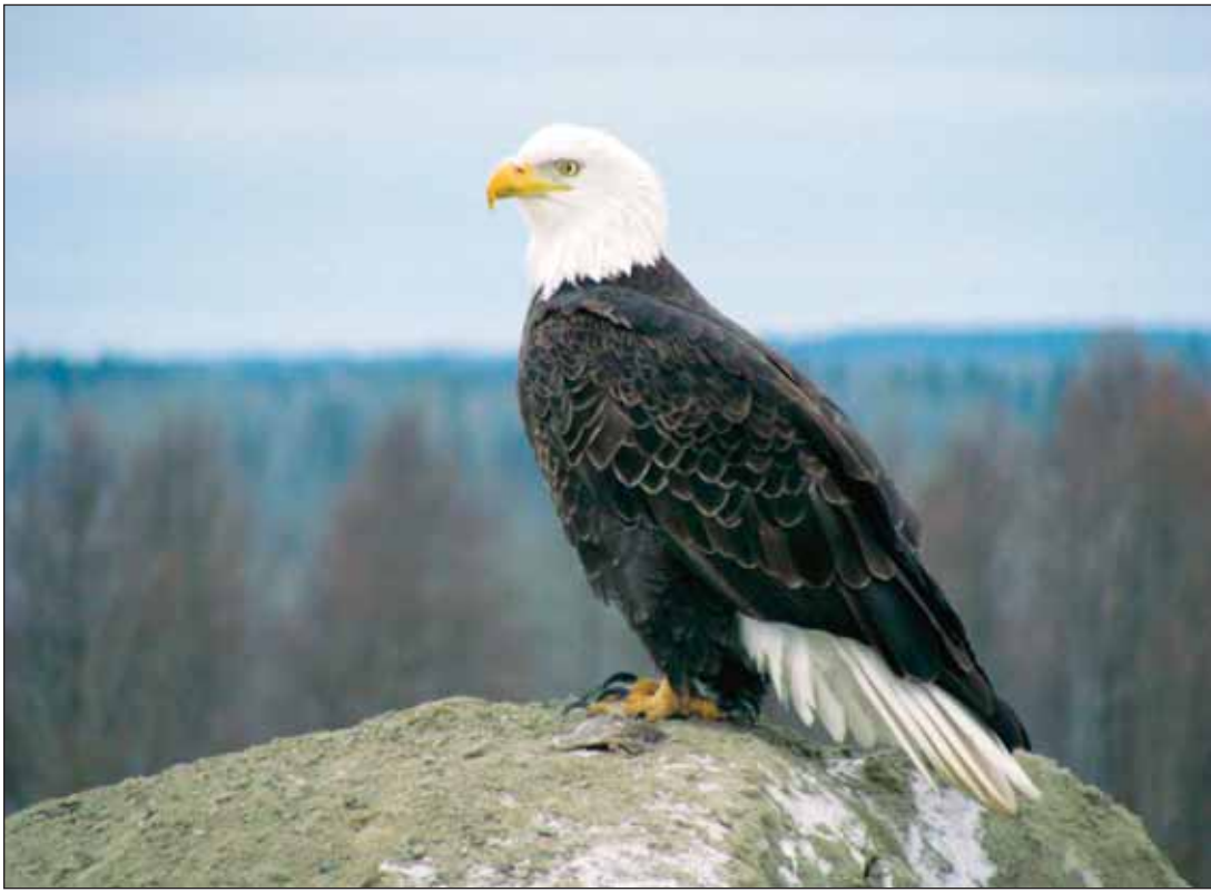
Who knew you could find so much beauty at the local dump? This is just one of about 15+ bald eagles that were hanging around that day. Simply amazing! The photo was taken January 7, 2012.

We invite readers to use this spot to show off a photo they are proud of or just think other readers might find interesting. No rules, just provide a sentence or two to describe the picture and send the highest resolution, not a reduced size for emailing.