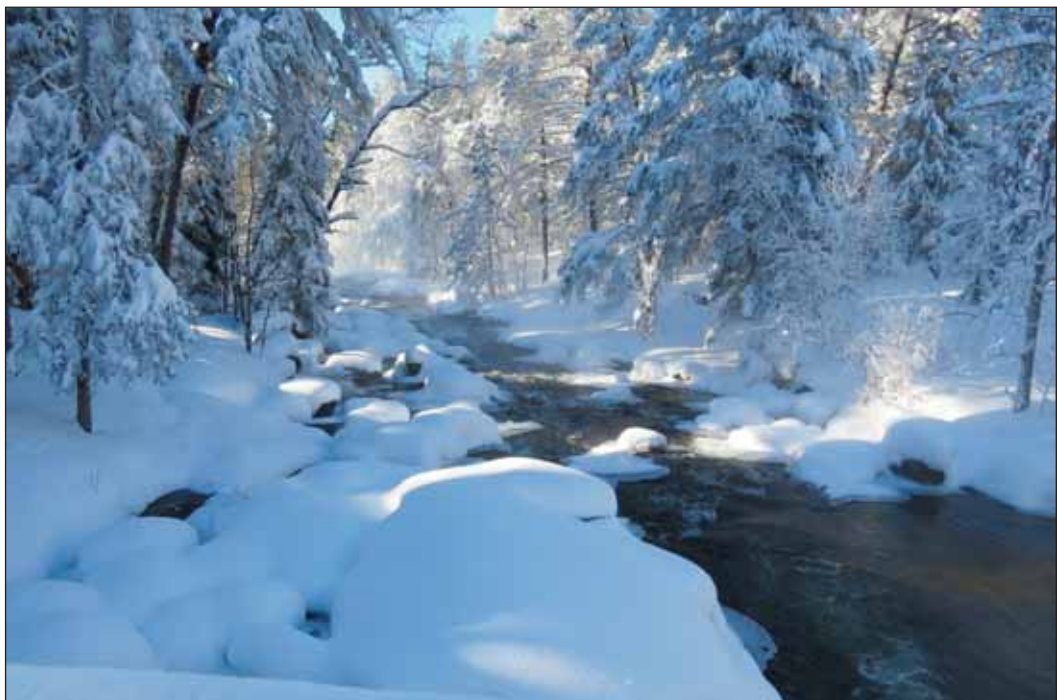
The beauty of a Northwestern winter. This was taken January 8, 2014, at Rushing River Provincial Park.