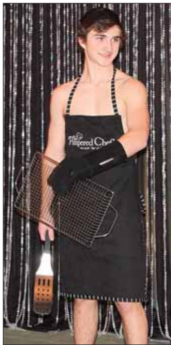
The Pampered Chef model was a hit during the fashion show.

Thirty-One, Mary Kay, Scentsy, Young Living Essential Oils and Pampered Chef.