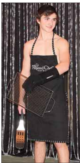
The Pampered Chef model was a hit during the fashion show.

Thirty-One, Mary Kay, Scentsy, Young Living Essential Oils and Pampered Chef.