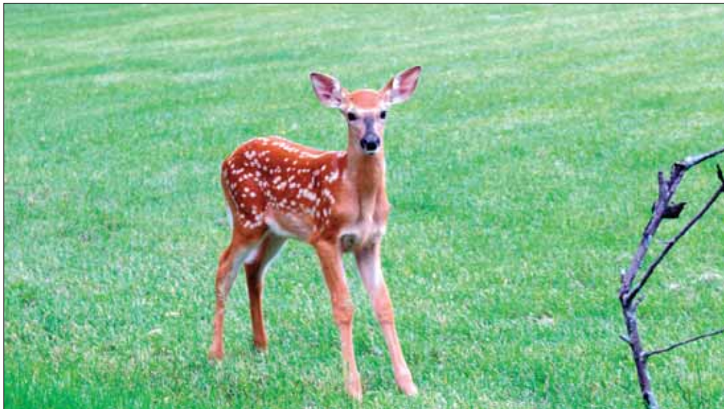
This little Bambi and its twin paid a visit to our backyard on June 26th. While the past winter was hard on many animals it is heartwarming to see many of their offspring thriving. Bambi's visit was a nice change from all the sandbagging.