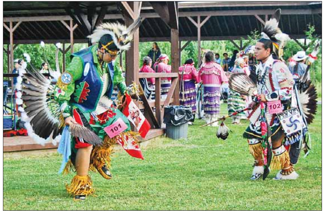
Competitors dance for points and prizes are awarded to the top contenders.