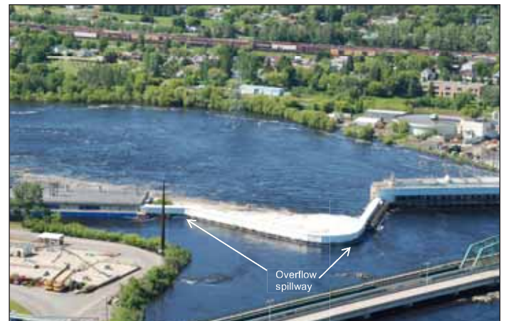
A broad view of the spillway shows the lay of the land in Fort Frances where the Rainy River begins.