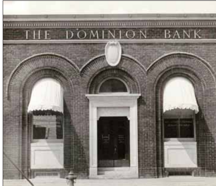
The Dominion Bank erects a new building at its current location on the corner of Scott and Mowat on February 8, 1922.