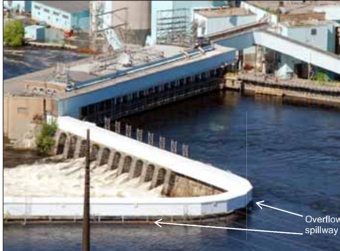
This spillway is designed to safely pass additional flow at high lake levels.

The press release went on to update about closures in the area, which now includes the 5 Mile Dock located on Couch-