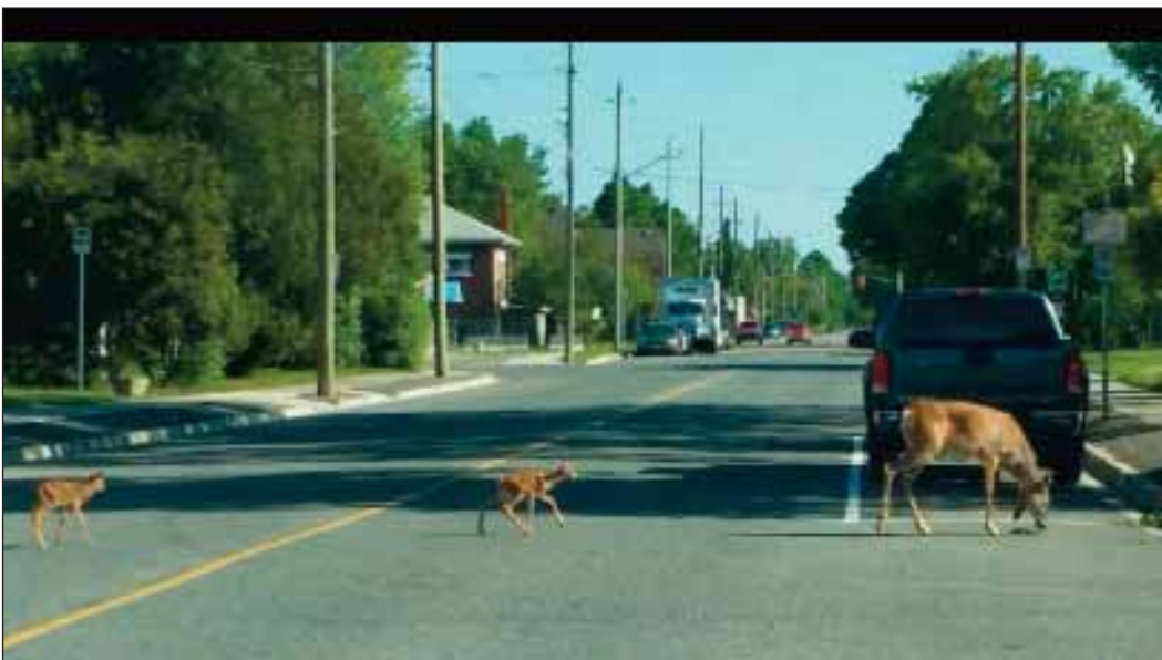
Northern Ontario version of Abbey Road