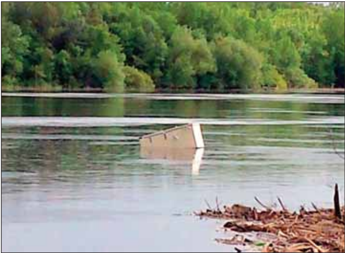
A lot of strange things have floated down the river in the last two weeks but a freezer? That was a surprise!