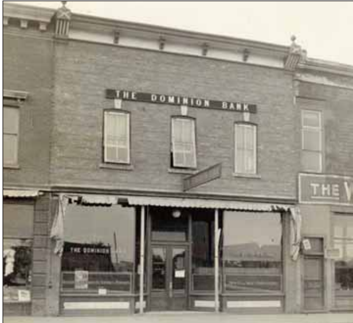
The Dominion Bank opened its doors June 20, 1914 at 232 Scott Street.