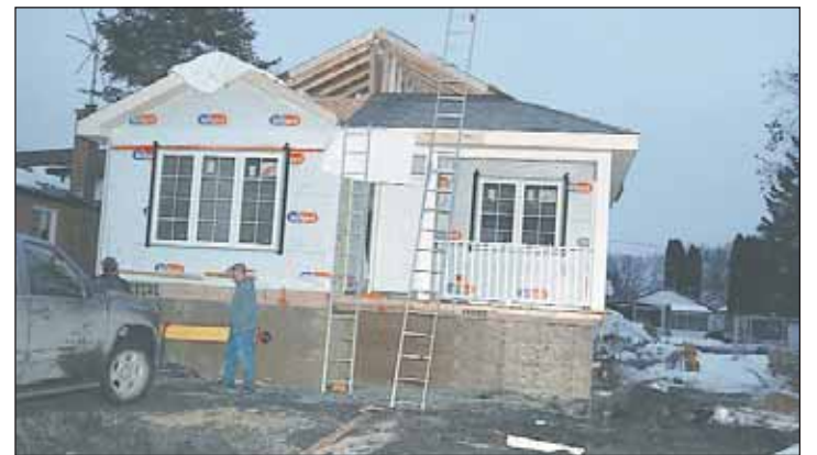
And voila! It's 4:30 pm and a new 3 bedroom home has appeared.