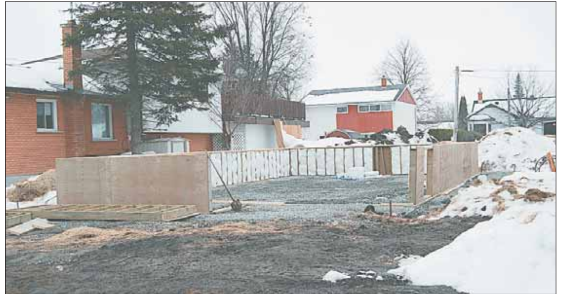
The site is made ready to receive the new structure.