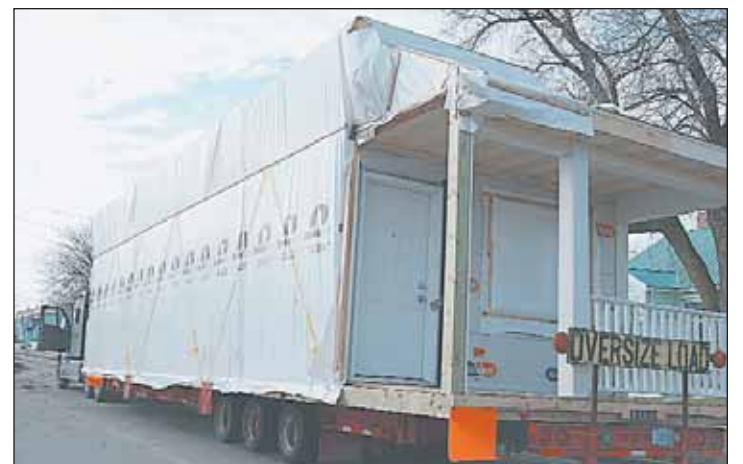
The second section is ready to be placed.