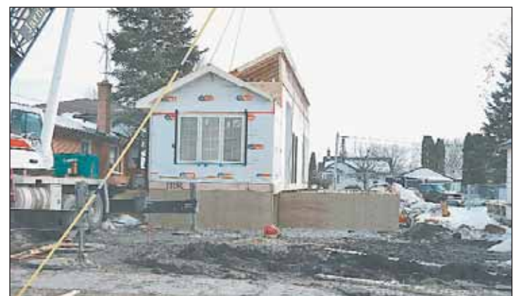
Section one is in place at 2:45 pm.

Mel did notice the number of people who came to watch and the many who pulled over their cars on side streets and walked over to get a better view. The 600 block of Second Street was closed for the duration of the process, but considering the few hours it takes to get the job done, there didn't appear to be too much inconvenience for anyone. It sure did provide quite a few people with something new to see and talk about.