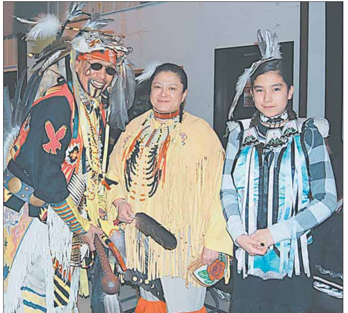
Participants from Onegaming and Brandon, MB