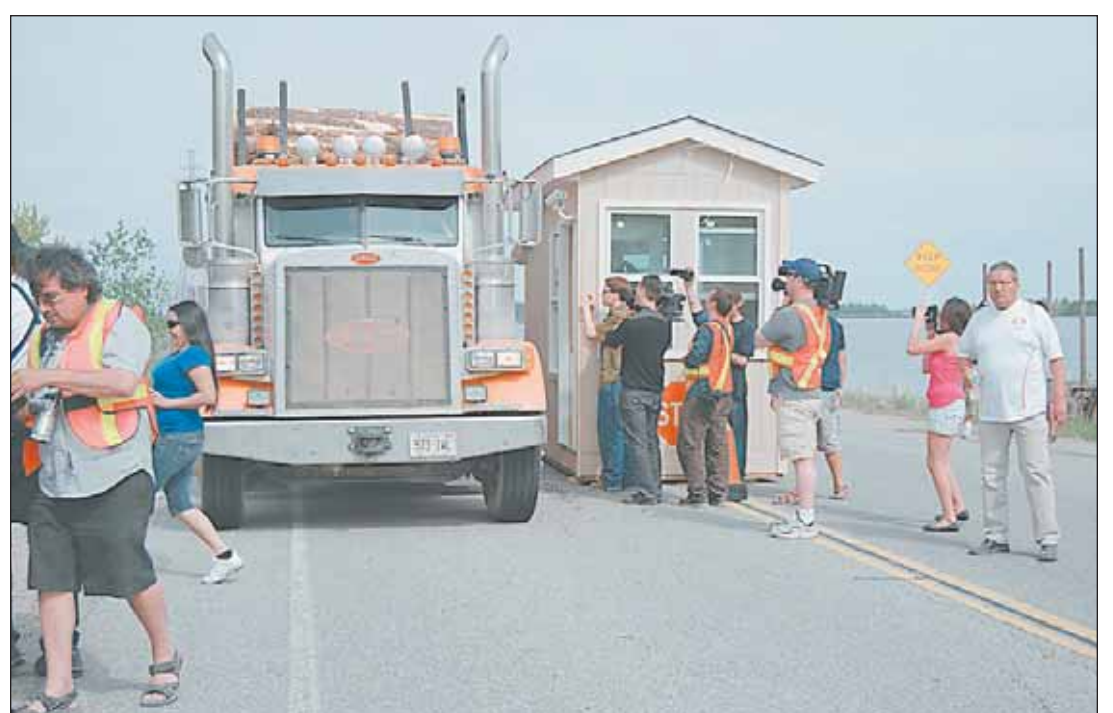
The first big rig makes its way through the toll booth.

To report a natural resources violation, call 1-877-TIPS-MNR (847-7667) toll-free any time or contact your local ministry office during regular business hours. You can also call Crime Stoppers anonymously at 1-800-222-TIPS (8477)