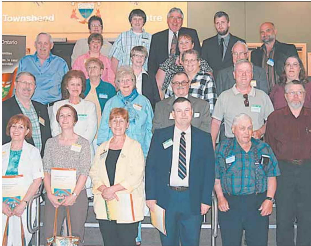
Recipients stopped for a picture after receiving their awards.