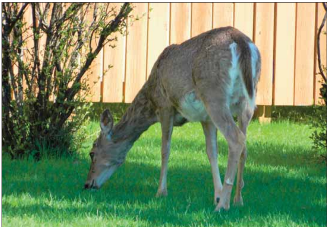
This is a photo I took last spring. There were five deer in my yard at Strachan Place in Fort Frances and they ignored me as I unloaded my vehicle and stopped to take a couple of shots.