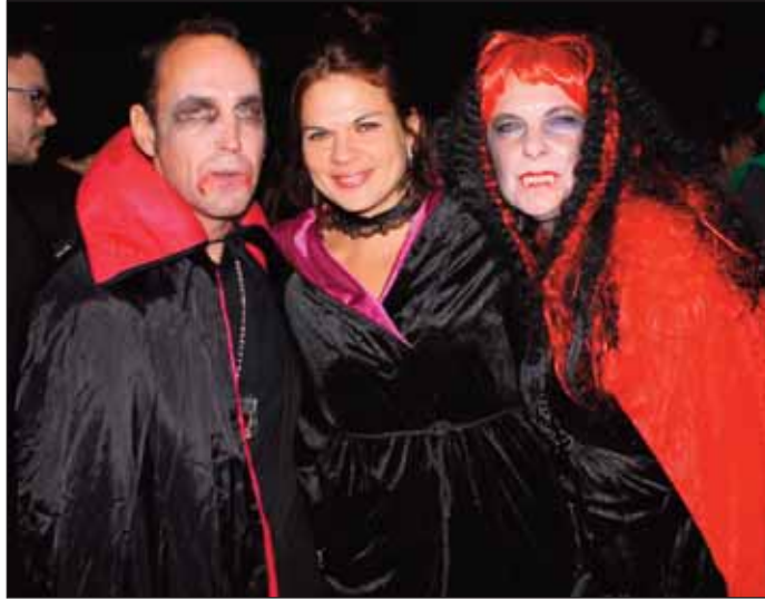
A Halloween party would not be complete without a few vampires in the house.