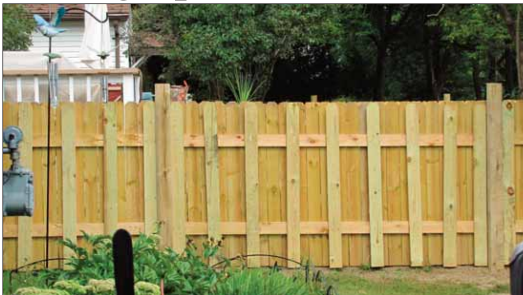
New version of compliant fencing in Fort Frances will reduce costs and increase artistic building techniques.