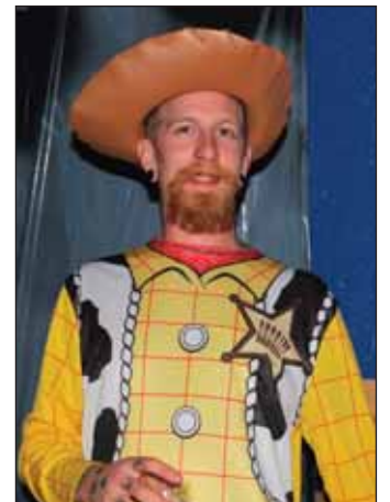
Woody from Toy Story was cutting loose at the Aurora Bar and Grill

With cornstalks and signs, a beer parlour, a telephone booth, a witch's room, a spider room, lots of skeletons, and a mantle