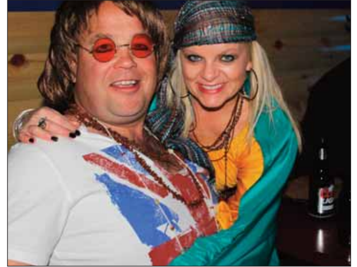
Ozzy Osbourne was seen stepping out with a gypsy girl...not sure if it was Sharon?