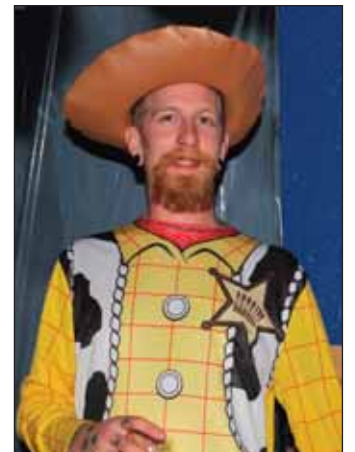
Woody from Toy Story was cutting loose at the Aurora Bar and Grill

With cornstalks and signs, a beer parlour, a telephone booth, a witch's room, a spider room, lots of skeletons, and a mantle