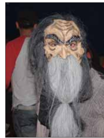
A wise old man!