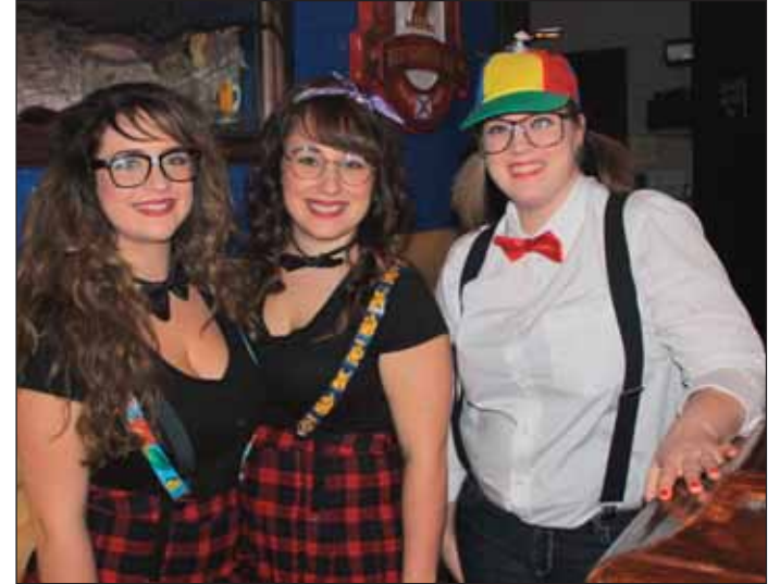
The 'nerdy' staff at the Aurora Bar and Grill got into the fun!