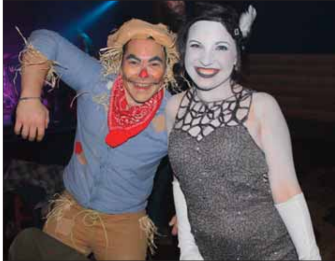
A scarecrow danced with his date, a character stepping out of a black and white movie.