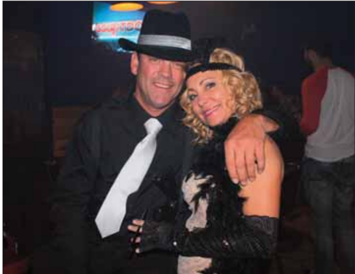
This couple at the Aurora took us back to the 'roaring 20's', a time of mobsters and flappers.