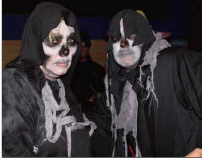
Halloween is said to be the night when the dead roam the streets and the graveyards come alive.