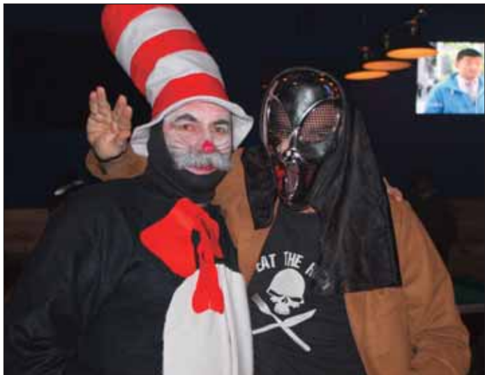
Do you recognize the mad hatter? And, who is that masked man?