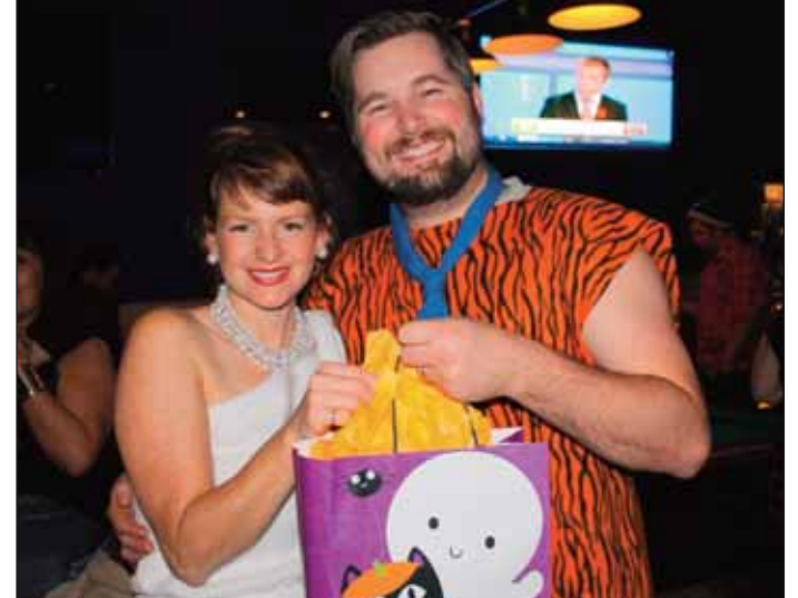
Wilma and Fred Flintstone picked up a prize for 'cutest couple'.