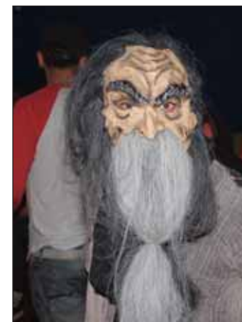
A wise old man!