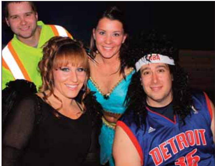
Who was the NBA player out partying with on Halloween?