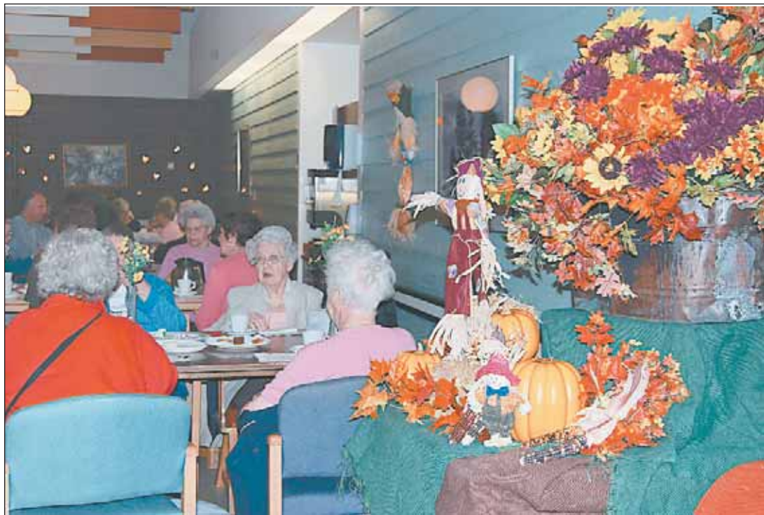
The decorating committee had a hayday with the profusion of fall colours.