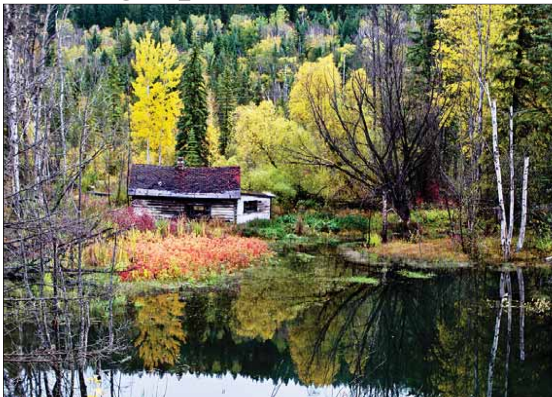
Autumn across Canada

Nestled in the woods off Hwy 95 in the East Kootenay region of British Columbia and surrounded by the colours of autumn, this abandoned cabin is slowly being reclaimed by the surrounding beaver pond.