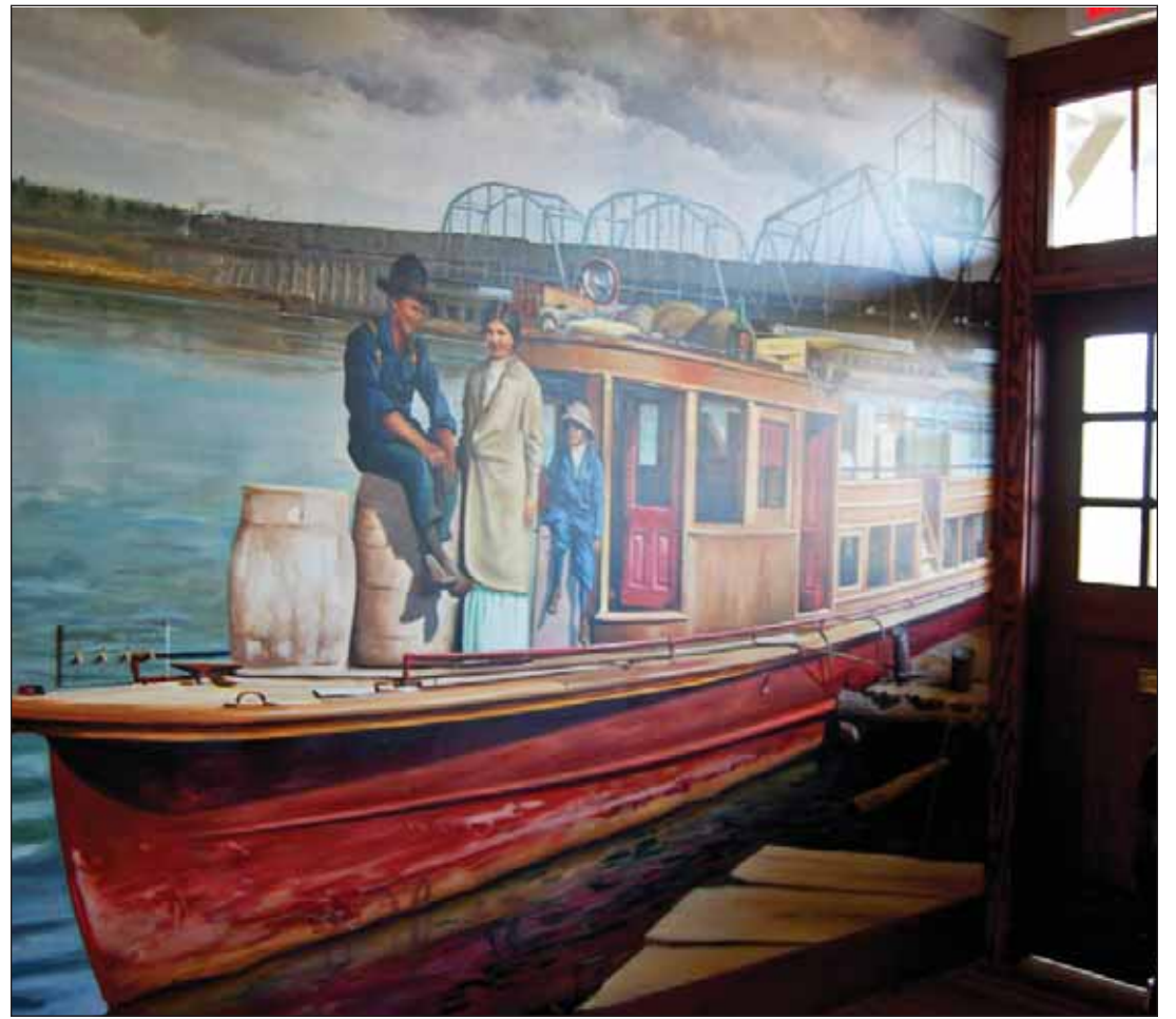
This mural depicts an early scene on the Rainy River at the train bridge crossing between Baudette and Rainy River.