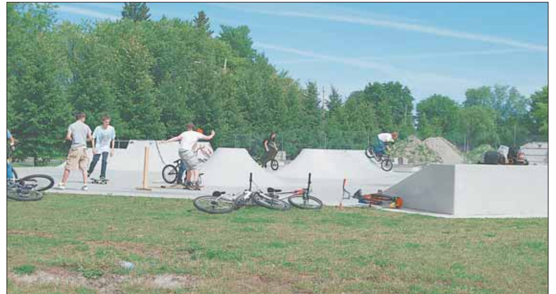
The Fort Frances Skate Park has been a hub of activity throughout the summer producing some very accomplished athletes.